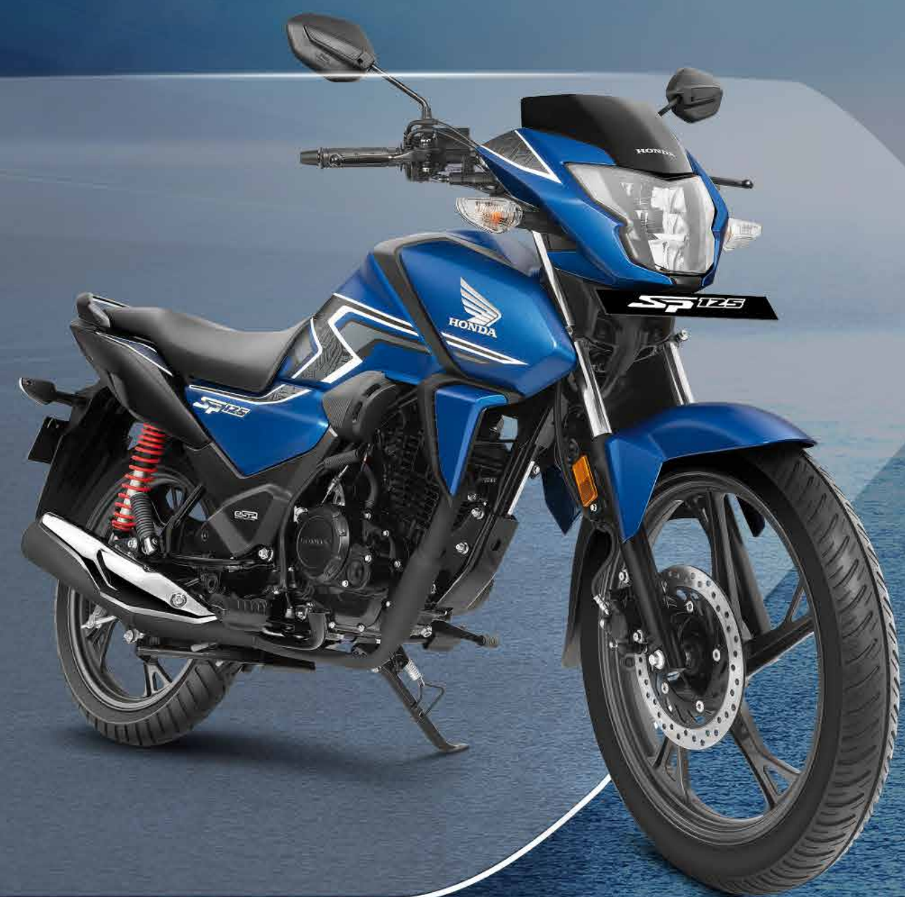
MAT MARVEL BLUE METALLIC